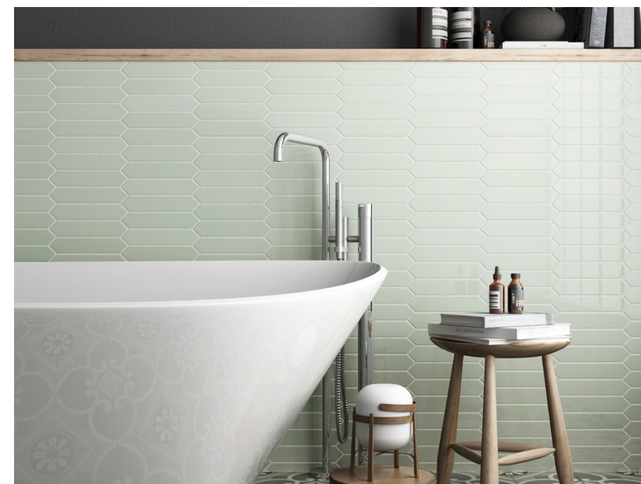
Arrow Green Halite 5 x 25 cm / 2" x 10"