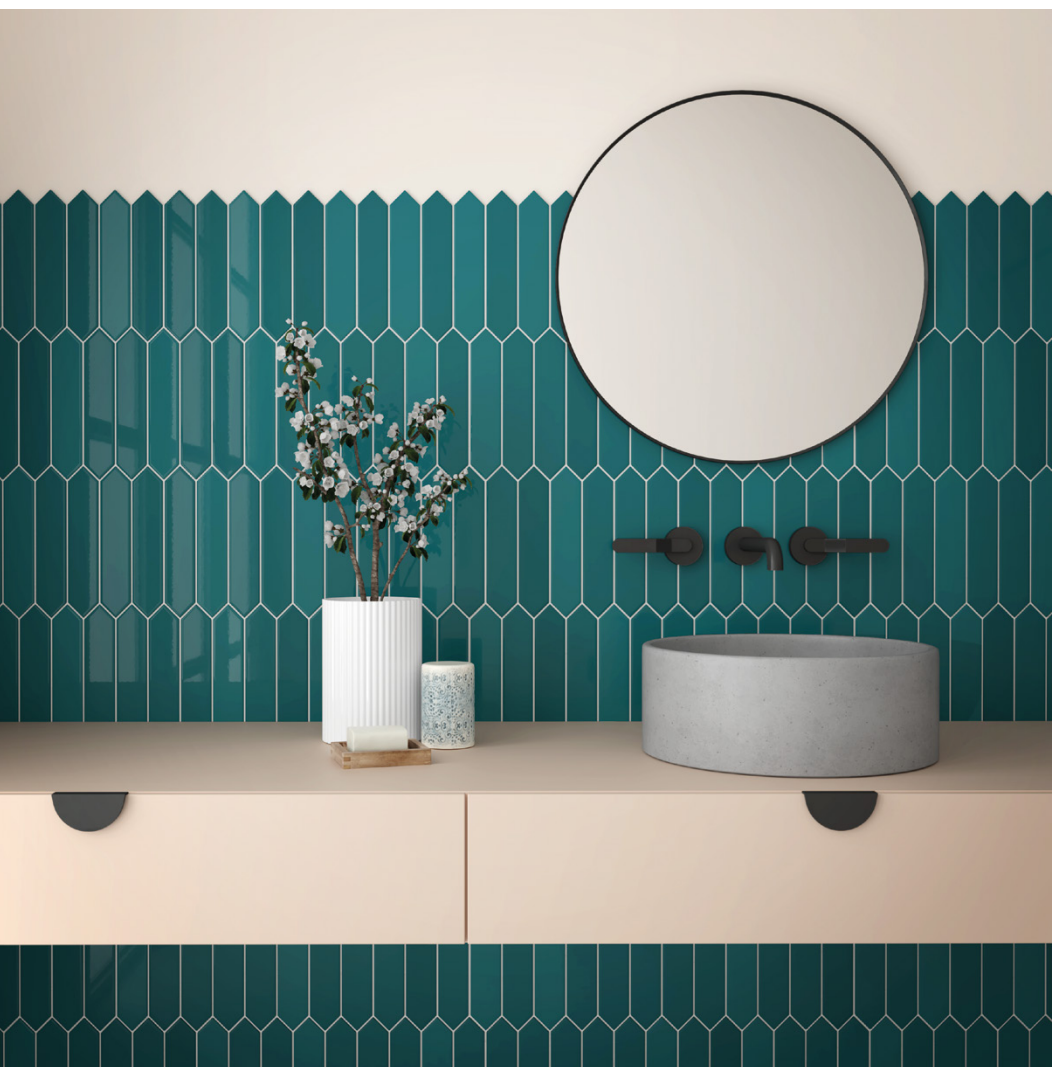
Arrow Blue Canard 5 x 25 cm / 2" x 10"