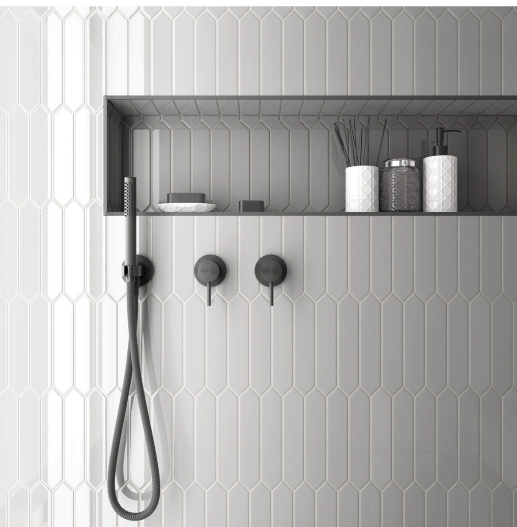
Arrow Quicksilver 5 x 25 cm / 2" x 10"