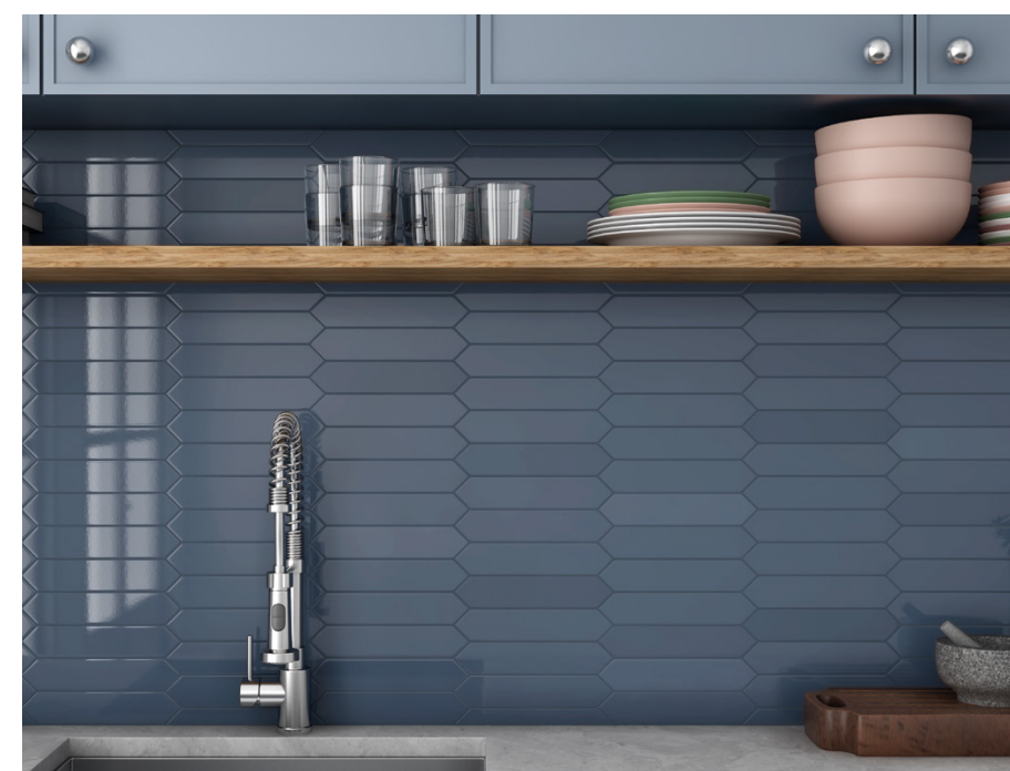
Arrow Blue Velvet 5 x 25 cm / 2" x 10"